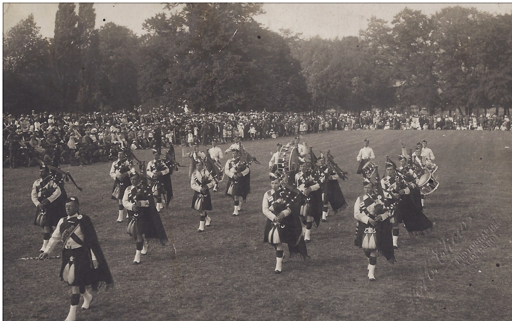
PIPES & DRUMS OF THE CAMERON HIGHLANDERS