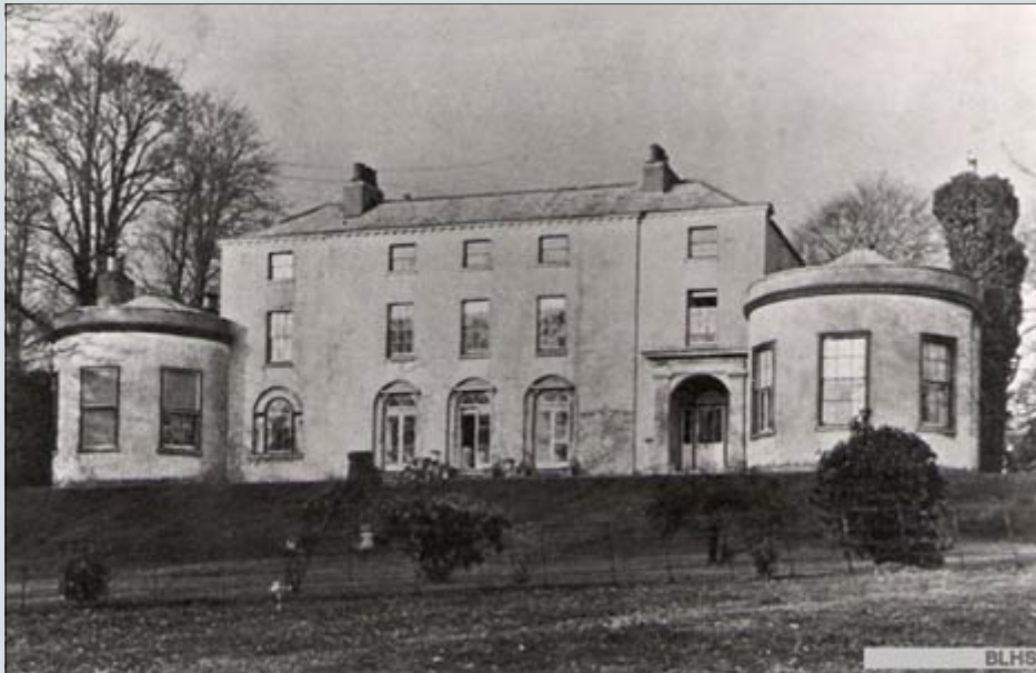
Bitterne Grove