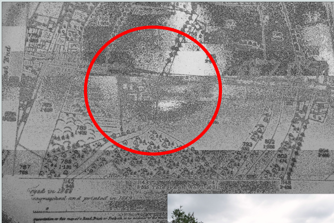
Above Section of 1910 OS map showing Laurel House later Donadea