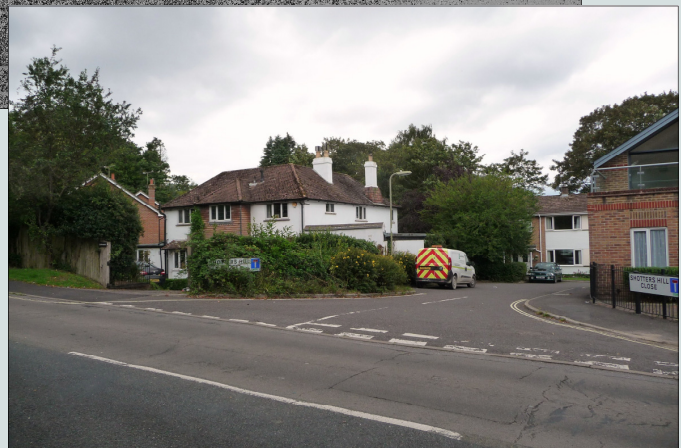
Right The Lodge of Laurel House/Donadea which still exists today as a private house although much altered