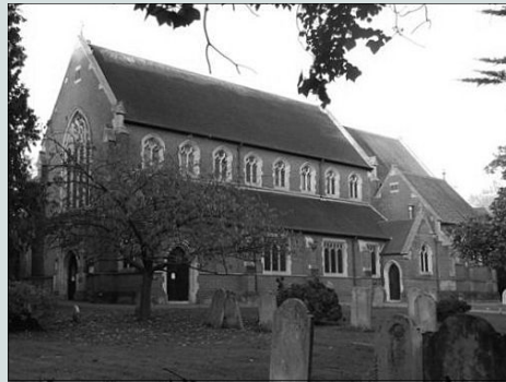
The new parish church of St James