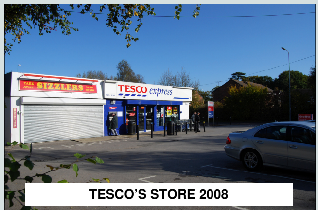
TESCO'S STORE 2008