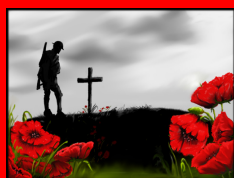
GREAT WAR 100