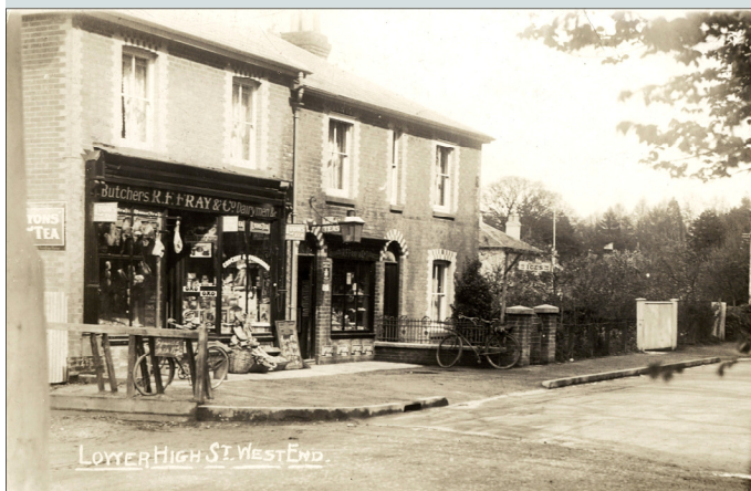
FRAYS STORE c.1930