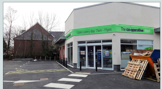
On the right: THE NEW CO-OP March 2017