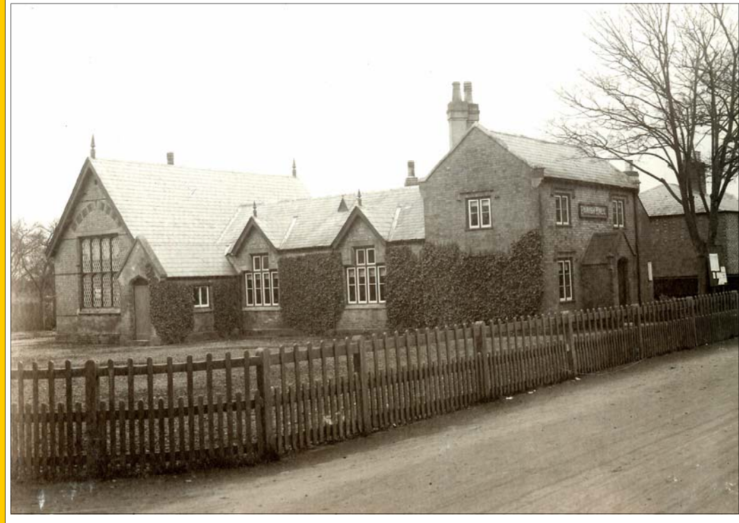
THE OLD NATIONAL SCHOOL PHOTOGRAPHED IN 1915 WHEN IN USE AS THE PARISH HALL

It was situated on the corner of High Street and Chapel Road, where today stands In-Excess and Netto's. Built in 1838 as Westend's first National School it became the village Parish Hall when vacated by St. James' School in 1903-4. The photograph of the building when seen above in 1915 still had the original fence enclosing the childrens playground. Seen on the right hand side is the two story original schoolmasters house with separate porch. On the left of the picture to left of the porch is the later added additional classroom. It was eventually deemed too small, old and costly to continue serving as the Parish Hall and was demolished around 1977-78 to make way for the present commercial buildings. More details and photographs of this nice old building can be viewed in our archives held at the Museum.