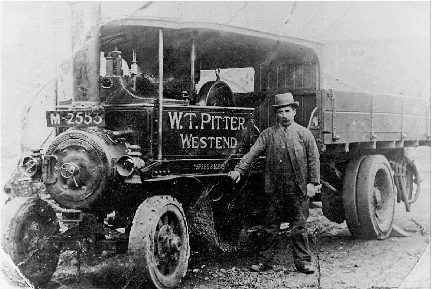
PITTERS STEAM LORRY ( The only known picture of this vehicle )

in the picture above it was restricted to 8 miles per hour, that would be limited to only 5 miles per hour whilst towing. Prior to this everything was horse drawn.