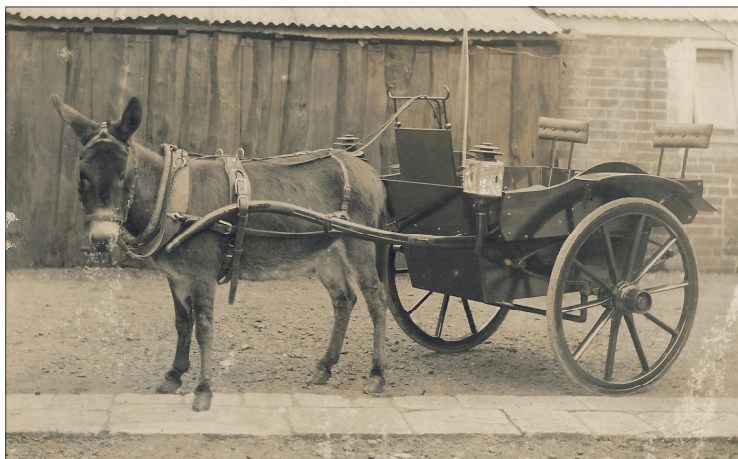
CLOSEUP OF THE DONKEY & CART