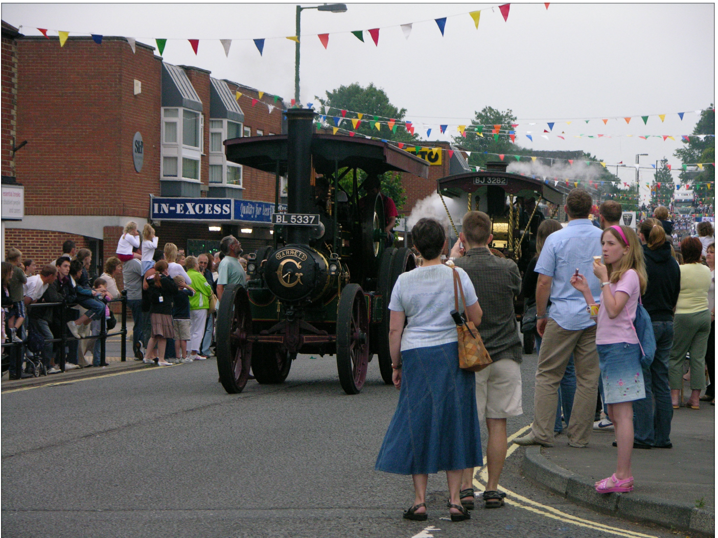
THE GARRETT STEAM TRACTION ENGINE 'DOROTHY' IN THE WEST END CARNIVAL PARADE 2005