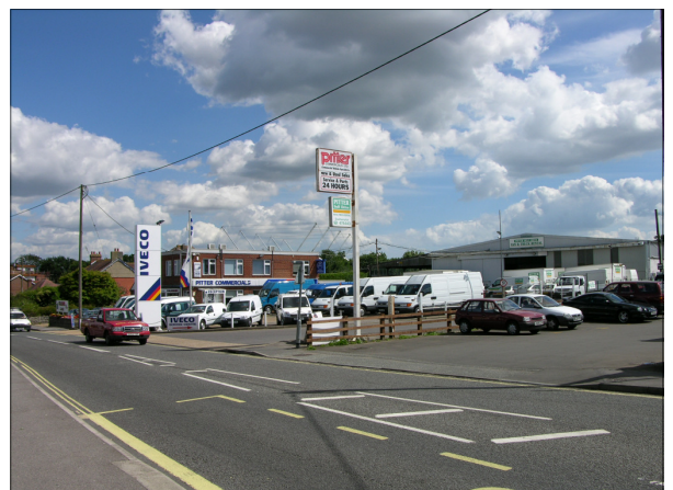
PITTERS PREMISES IN 2005