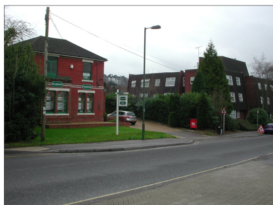
MR PARKERS HOUSE ON THE CORNER OF UPPER NEW ROAD-HIGH STREET IN 1969 AND TODAY A BLOCK OF FLATS