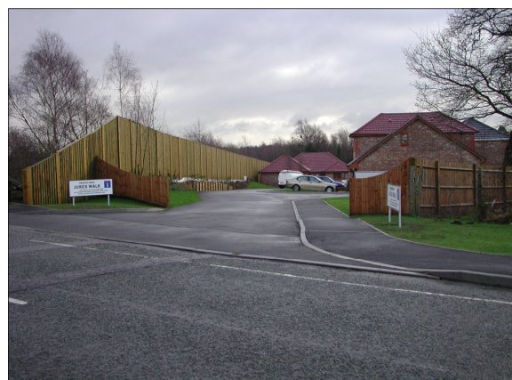
THE RUINED MOORGREEN HOUSE IN 1995 AND IN 2000 AS NEW DEVELOPMENT JUKES WALK OFF MOORGREEN ROAD