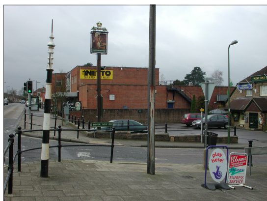
WEST END BREWERY CORNER OF HIGH STREET-LOWER NEW ROAD EARLY 1900's AND TODAY WITH NEW PUB SET BACK