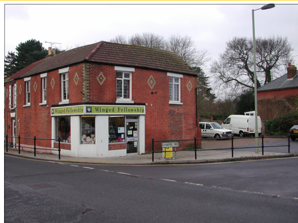
GENERAL STORE ON THE CORNER OF HIGH STREET-CHAPEL ROAD AROUND 1900 AND AS THE WINGED FELLOWSHIP IN 2000