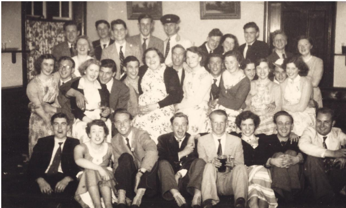
From the archive: West End Villager's Coach Trip 1950s

Please ensure you provide your full name.